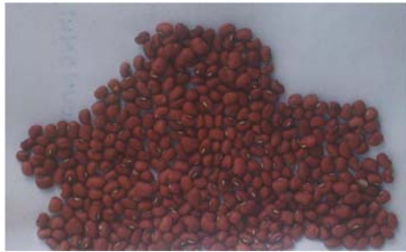
Figure 2. Brown Solojo Cowpea.