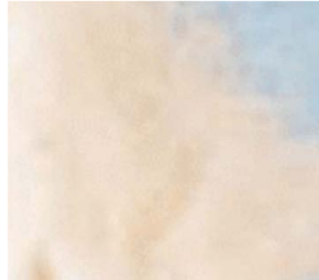
Figure 4. Pulverized Brown Solojo Cowpea.