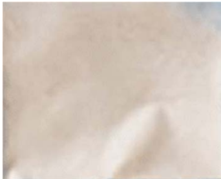
Figure 3. Pulverized Dark-ash Solojo Cowpea.