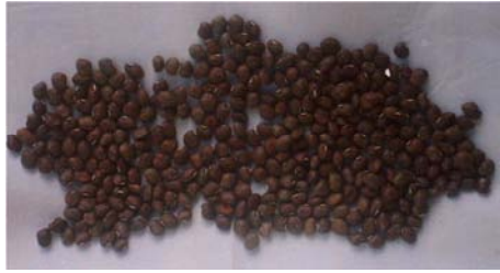
Figure 1. Dark-ash Solojo Cowpea.